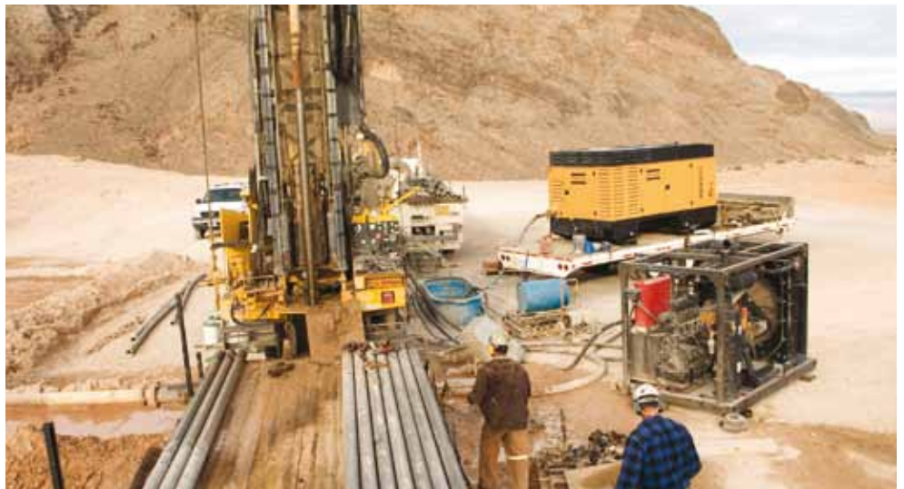
The site is laid out for easy access to plumbing and for observation of gauges by the driller.

The formation was described as "red clays and chalky near the surface with carbonates going deeper." From that point drilling continued with air, supported solely by the rig's compressor. It worked well for the crew to drill a 6½-inch pilot hole and then ream the hole with an 11-inch bit. For the 6½-inch hole the crew tried out