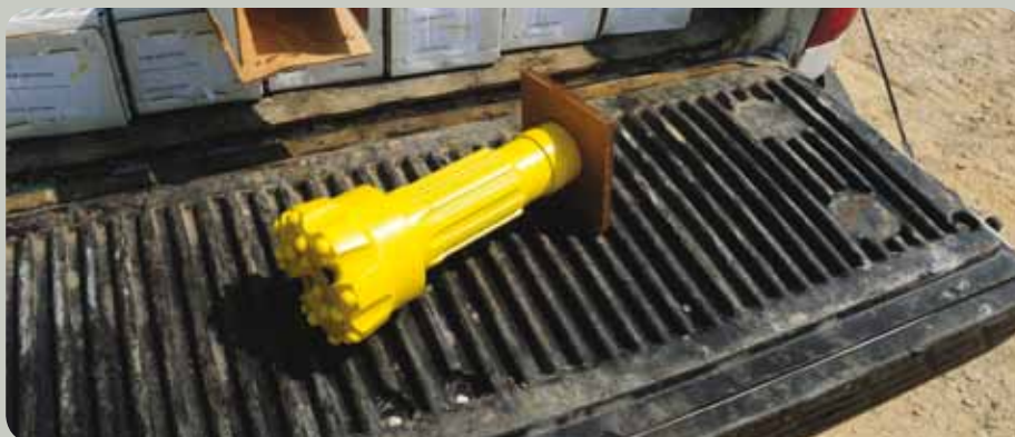
The 5 3/4-inch bit features Atlas Copco's own BH66 hemispherical carbide buttons. The bit proved more cost-effective than diamond bits, which were the only other bit Mid-State Drilling's trials found capable of drilling to 500 feet total depth in difficult sandstone conditions.