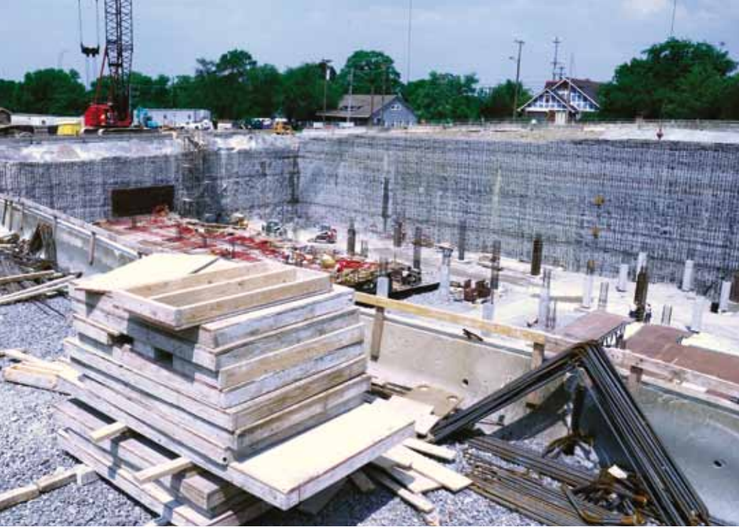
The geothermal loop field was installed alongside the 60-foot (18-meter) excavation for the College of Law's new facility. Incidentally, the perfectly parallel bores on the excavation's walls represent the signature line drilling also done by Mid-State with an Atlas Copco T4W but with a 6 1/2-inch bit.

» The company has exactly the right equipment to maintain uninterrupted production at each of its concurrent projects. Of its 125-piece fleet, 30 units are drilling rigs. Among the larger machines are 12 Atlas Copco T4W rigs and a T3W.