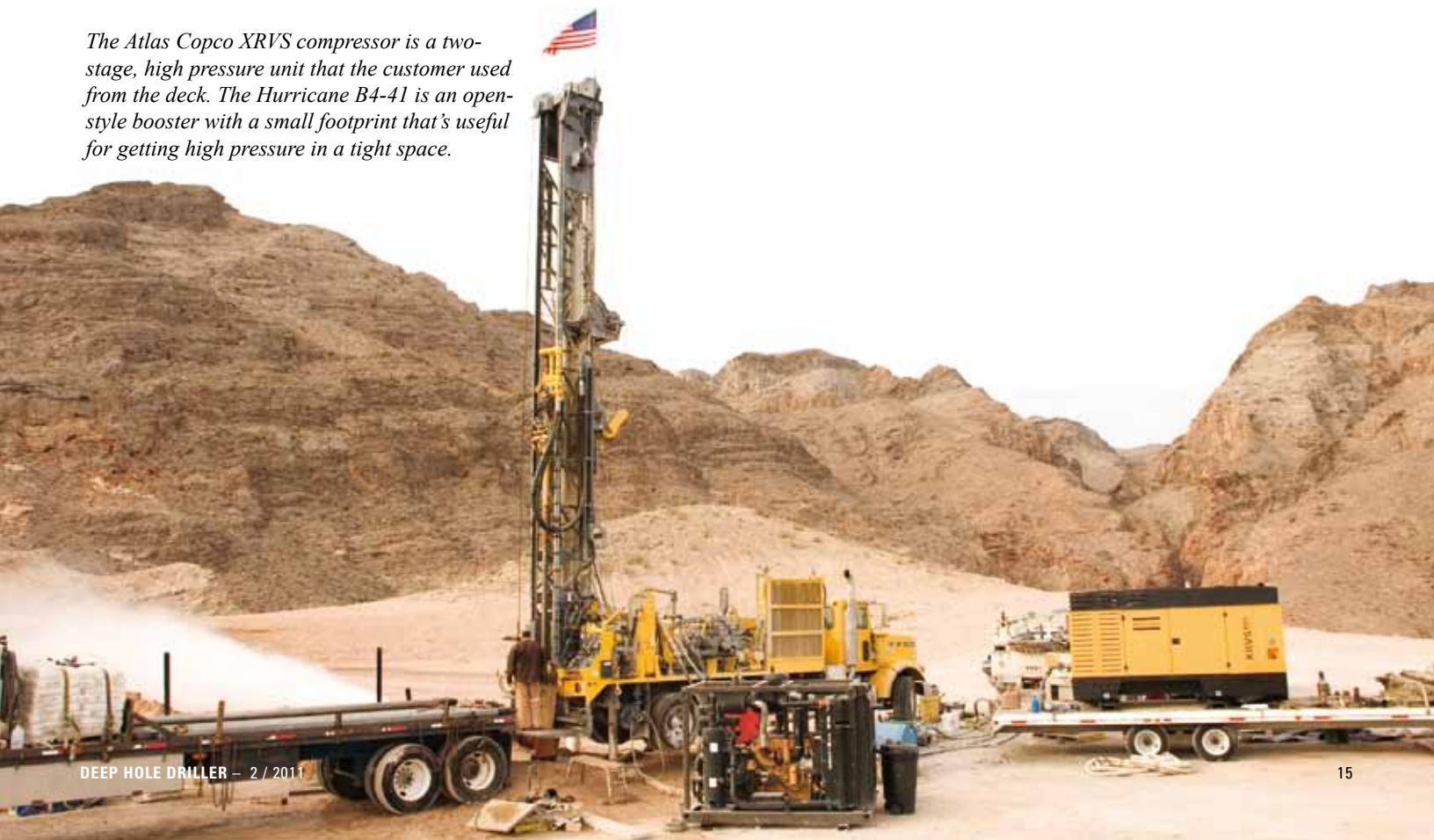
The Atlas Copco XRVS compressor is a two-stage, high pressure unit that the customer used from the deck. The Hurricane B4-41 is an open-style booster with a small footprint that's useful for getting high pressure in a tight space.

Through the monitoring process made possible with the TH60 and high pressure air, the amount and quality of groundwater for one of the world's most recognized cities, which happens to be in the vast desert of Nevada, will continue to be tracked for future generations. 🌐