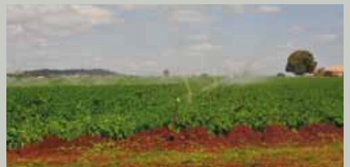
The irrigation system keeps the Serra's Kipfler potatoes well nourished. Also shown are boxes of the potatoes ready to be distributed.