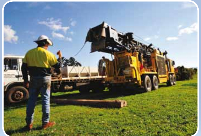
Joe Serra can point out the area where ancient volcanic flows formed the table lands and created the variations in formations.

The distance the family drilling business will travel has grown over the years. Population and farming development has leveled off. So, Australia's mining industry has developed into a »